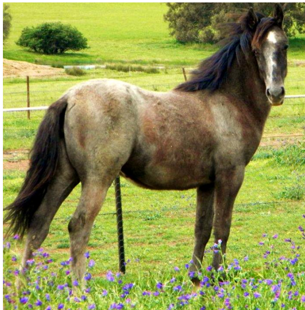
Above Left: 279 Monza.