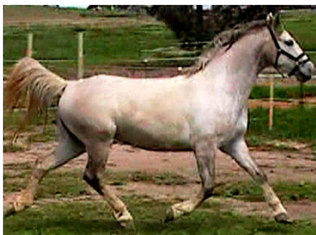
Above Left: 237 Sagana