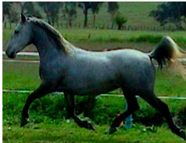
Above Right: 254 Londra