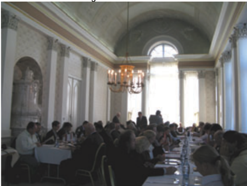
Left: The beautiful chamber of the palace at Topol'cianky showing the LIF General Assembly in progress. We apologise for the poor quality of the photograph.

Please note that the LAA does not contribute any funding at all to it's representatives for international meetings.