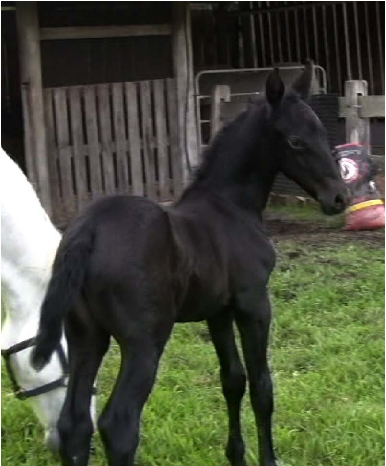
Photo at 6 days of age.