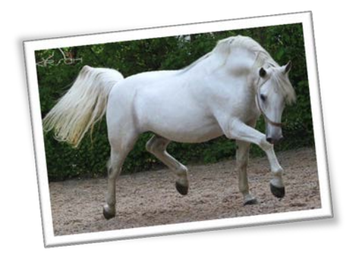
KL Siglavy Pastime 88 – Sire of KL Generale 321

Annwn Park has been searching for a new line to bring into Australia for some time. We had considered bringing in a new stallion however at this stage & in such a small