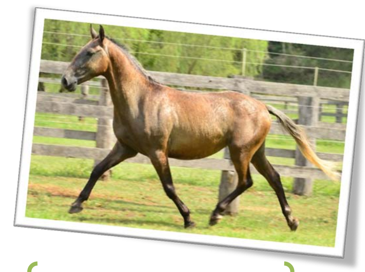
SOLD! 287 PLUTO SARITA V gelding from Di Baxter, Omaru Stud