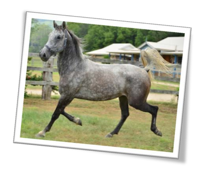
277 FAVORY FIERRA - gelding, from Di Baxter, Omaru Stud