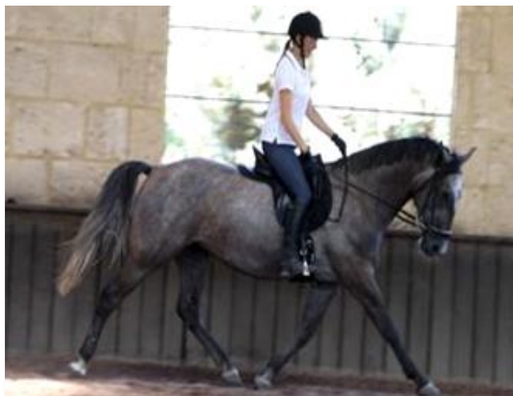
Left: 253 Styria