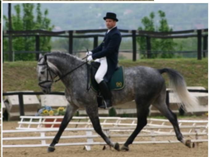
Top from left: Kappel Edit/Pluto XXXIII – 4, Kappel Edit/Favory XXVIII – 42 Kappel Edit/Favory XXVIII – 5, Mikó Tamás/Favory XXVIII – 26 The horses' stable names are Paktum, Faktor, Foton and Faust.