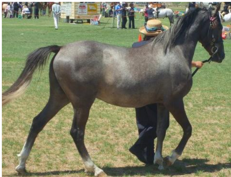
Left: Conversano Trieste - 2007 Purebred Lipizzaner gelding

(224 Conversano Allegra V imp x 216 Trieste)