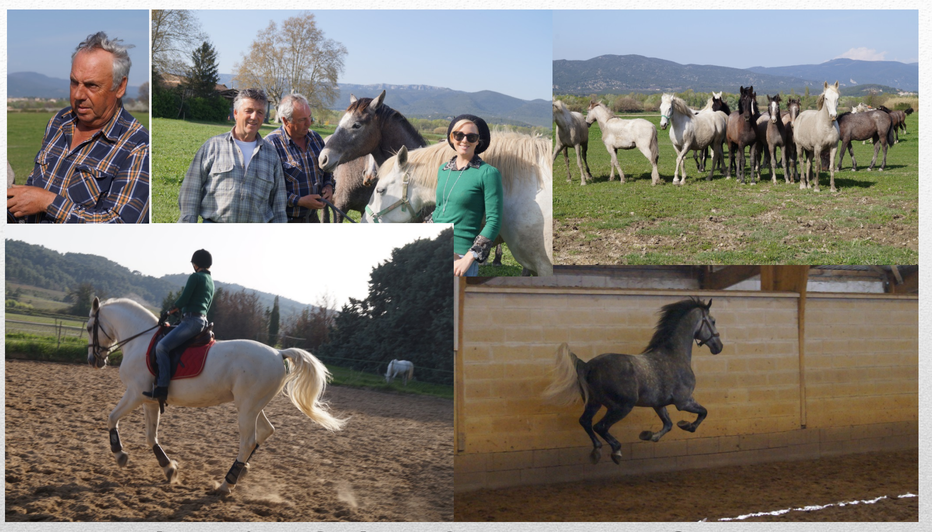
A day in Sth of France Cont...